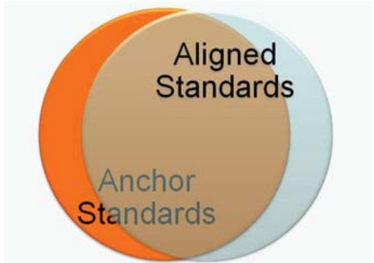
Figure 1: Standards-to-Standards Alignment (1)

In Figure 1, the term “Anchor Standards” is defined as the expectations one aligns to, e.g., state standards/assessment frameworks, and “Aligned Standards” are expectations to be aligned, e.g., learning targets. For example, one might want to align a set of nationally recognized mathematics standards at 4th grade to another set of mathematics standards at 4th grade believed (or hoped) to be comparable. A high degree of overlap (i.e., match, depth and breadth) would represent good alignment, hence comparability. However, Figure 1 portrays alignment between highly similar content domains—in this example 4th grade mathematics. However, this would not be the expected relationship between associated domains, such as elementary mathematics academic language standards for grades 3 through 5 and 4th grade mathematics content standards. More explicitly, one would not expect language proficiency standards and mathematics content standards to exhibit the same degree of alignment as seen in Figure 1. The alignment between language proficiency standards and academic content standards might be best reflected in Figure 2.